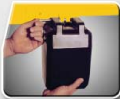
Quick Connect Chain Container