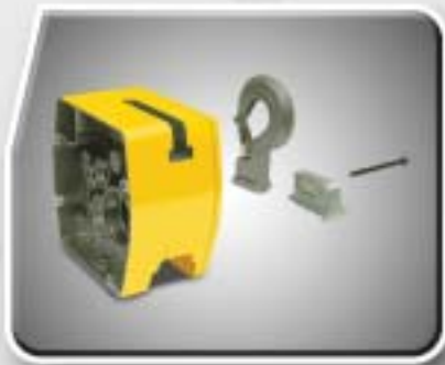
Easy Change Top Suspension