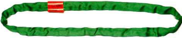
Polyester or High Strength Aramid