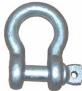
Screw Pin Anchor Shackle