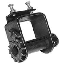
Winches & Winch Bars