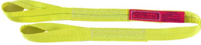
Webmaster 1600 and 1200