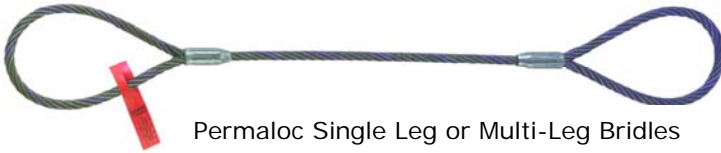
Permaloc Single Leg or Multi-Leg Bridles